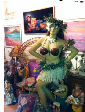
One of "the girls"

And what is their largest collection? Storage boxes!