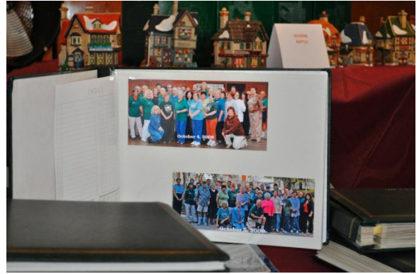
A Goodly Group!