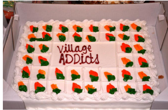
The REALLY Good Stuff!