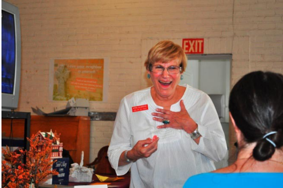
Those "bugs" were everywhere!