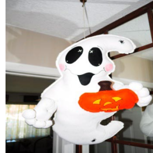
Bingo was fun!