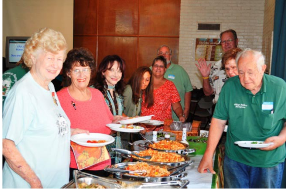
The Dynamic Duo