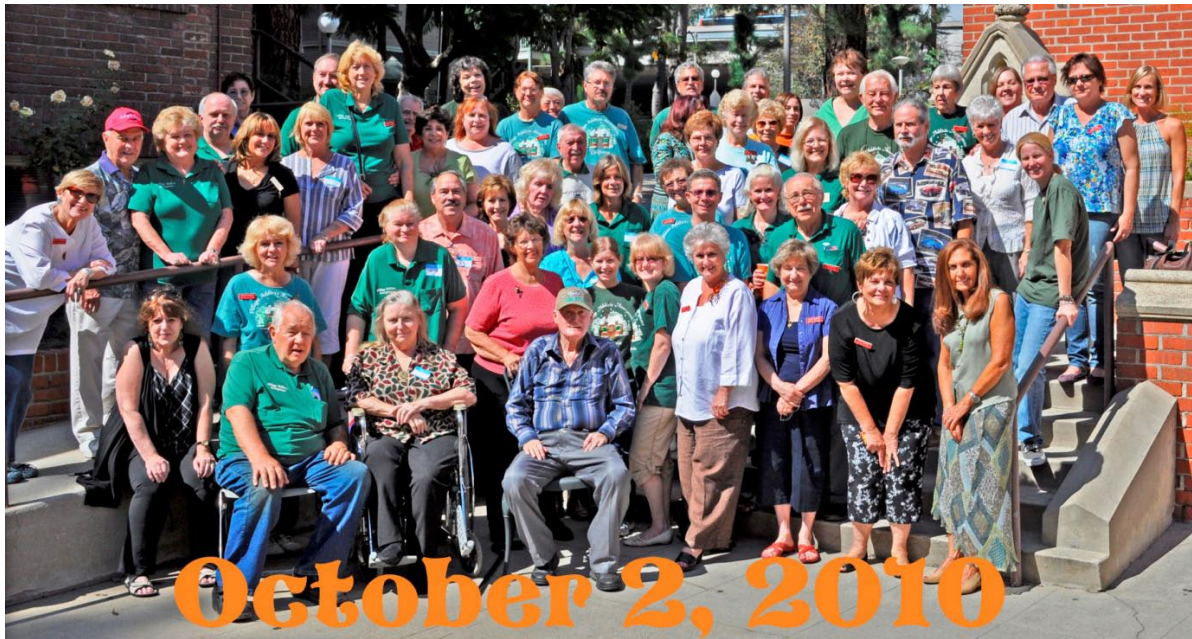
A handsome group if I do say so myself!